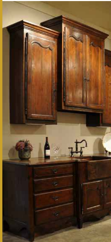
< Country French Wet Bar

Contact our Atlanta showroom for information on styles and custom sizing.