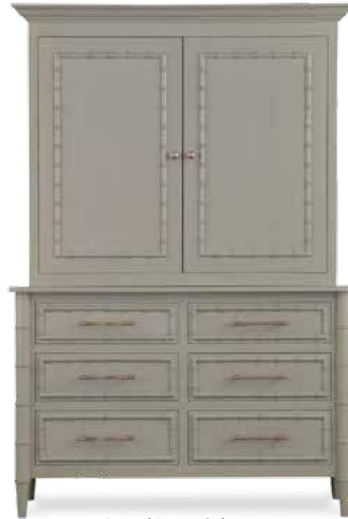
Bristol Linen Cabinet

The linen cabinet shown to the left is the perfect complement to the Bristol sink base but can be done in any style with any finish and hardware.